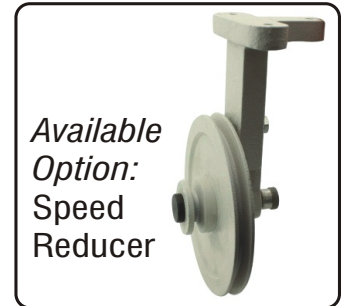
Available Option: Speed Reducer