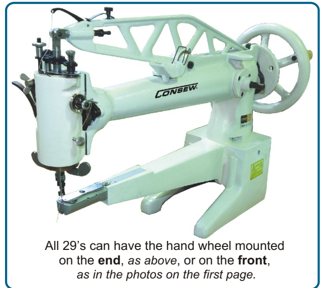
All 29's can have the hand wheel mounted on the end , as above, or on the front , as in the photos on the first page.