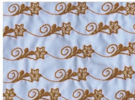
Outstandingly Beautiful Stitches