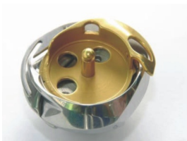
Titanium coated Hook