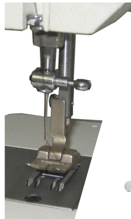
Closeup of needle adjusted to left position.

* Speed depends on width of zig-zag, material and thread.