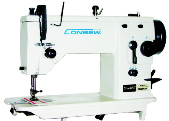
Also available is the traditional CN2093R NON-direct drive machine