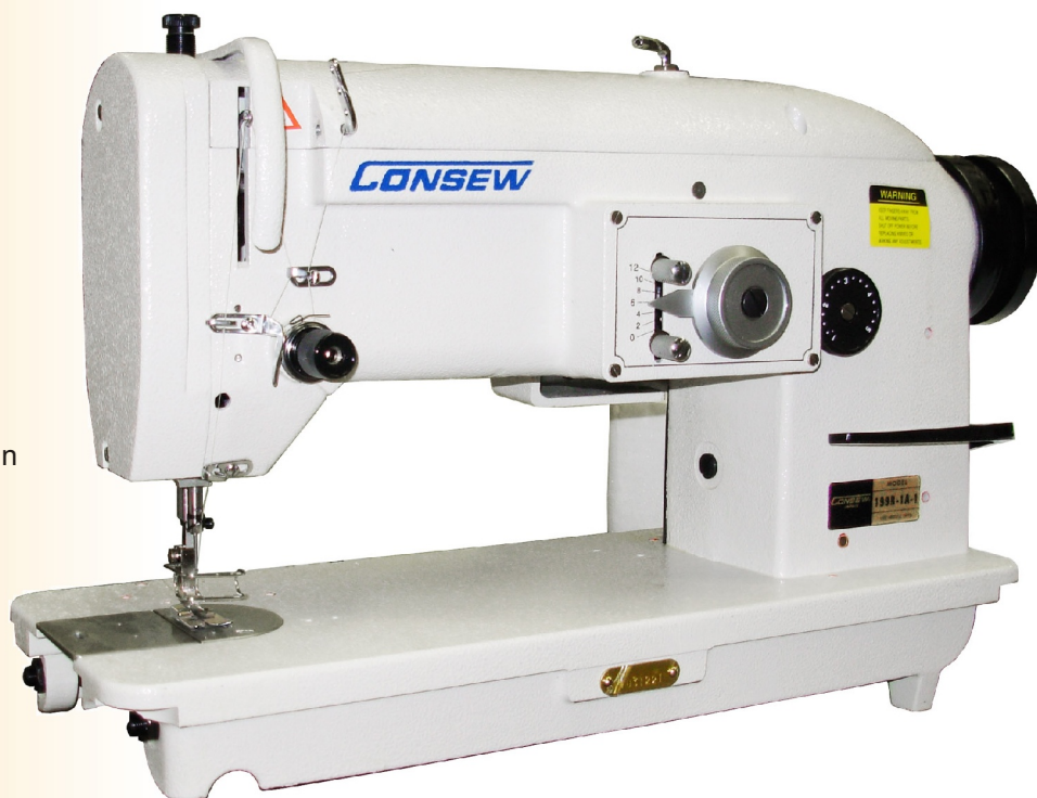
199RB-1A-1 Large Bobbin

COMBINATION ZIG-ZAG AND STRAIGHT STITCHER