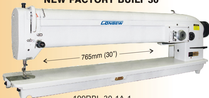
199RBL-30-1A-1 Special order (1A, 2A, 3A) Long arm with 30" work space