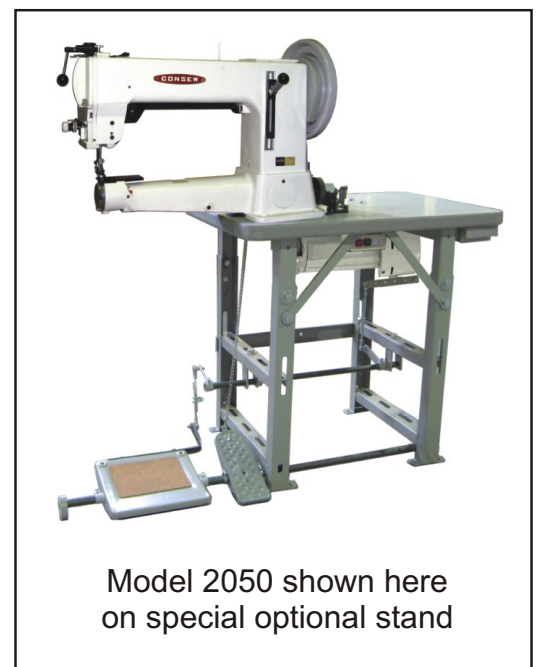
Model 2050 shown here on special optional stand