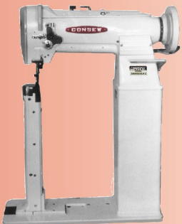
MODEL 289RB-HLP-2 with 17-7/16" (443 mm) post height

HIGH SPEED POST TYPE SINGLE NEEDLE DROP FEED, NEEDLE FEED WALKING FOOT ALTERNATING PRESSER FEET LOCKSTITCH MACHINE