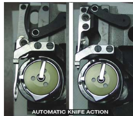
AUTOMATIC KNIFE ACTION