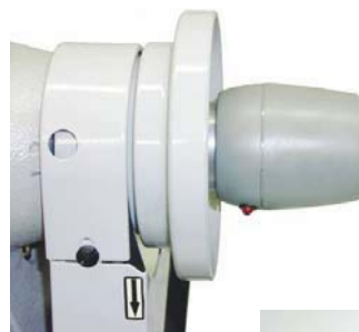
Belt Guard, Hand Wheel & Automatic Synchronizer