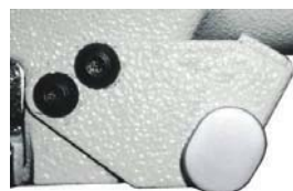
Push Button Reverse. Automatic Backtack Button conveniently located to the right of the needle