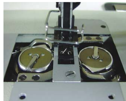
Two Large Horizontal Hooks and Bobbins