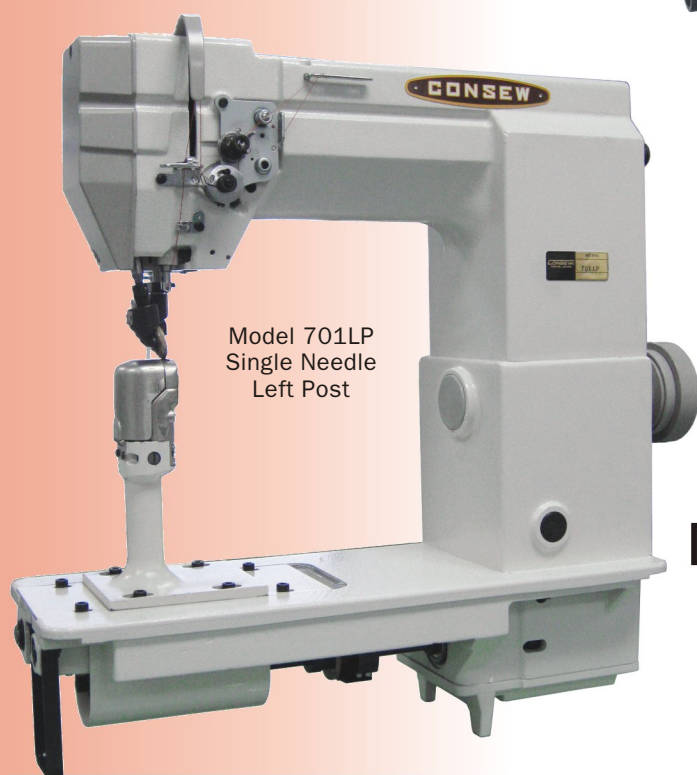
Model 701LP Single Needle Left Post

HIGH SPEED SINGLE AND TWO-NEEDLE POST BED LOCKSTITCH MACHINES