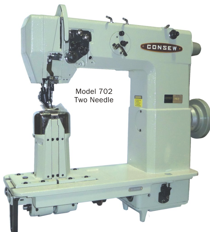
Model 702 Two Needle