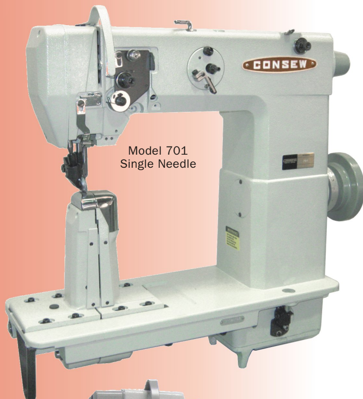
Model 701 Single Needle