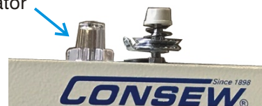
Oil Glass Indicator