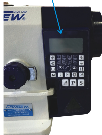
Auto-Function Programmer and Stitch Counter