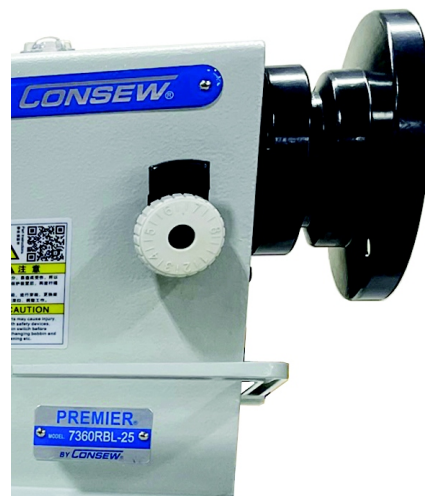
Standard pulley-type drive system

* Speed depends on operation, materials and thread