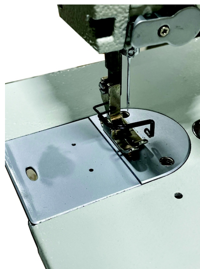
Standard Interchangeable Presser Feet

Note: These are plain machines which require a table, stand, motor and belt in order to operate. Inquire from your dealer as to add-on functionality