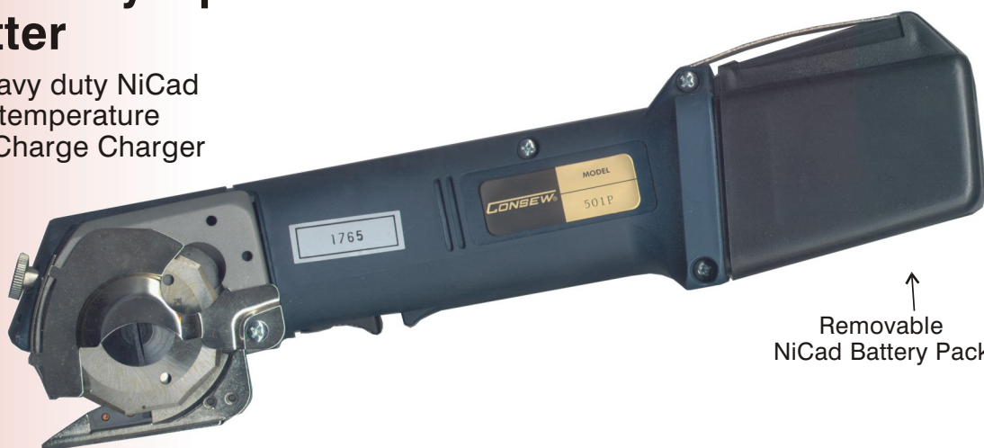
Removable NiCad Battery Pack

This cordless heavy duty electric shear works like a pair of hand shears only faster, cleaner and easier. Cuts material of up to 1/2" (12 mm) in thickness, including knitted fabrics, leather, carpet, fiberglass, etc.